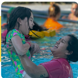
2 Heated Swimming Pools