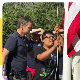
Front Porch/Flag Area

There is a large dining hall that accommodates all campers and staff where we have our three daily meals (and snacks). Additionally, we take campers on trips to the arcade, museum, aquarium, sailing, beach, and more!